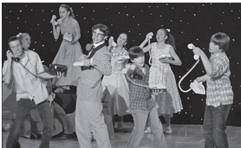
BYE BYE BIRDIE: Best Broadway Production 13-15, 2nd place