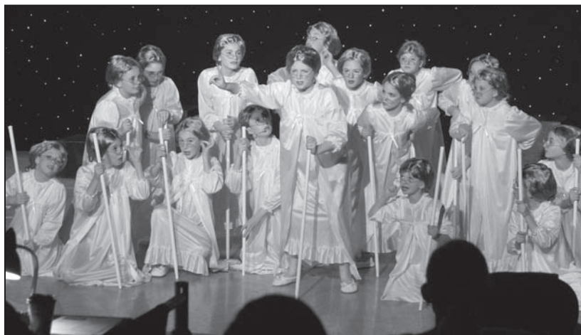
KIDS: Best Broadway Vocal Production 8 & under, 1st place