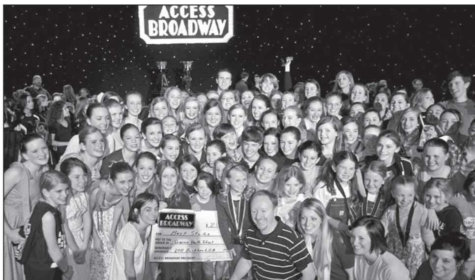
OYSP students and teachers celebrate Best Studio award